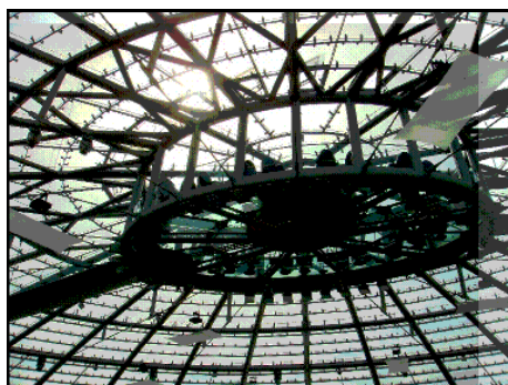
'Glass' roof restaurant at Hangar 7, Salzburg