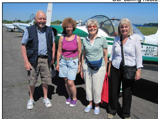
Our sailing hosts