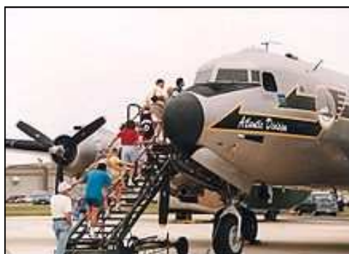
C54 with Visitors at Dover AFB