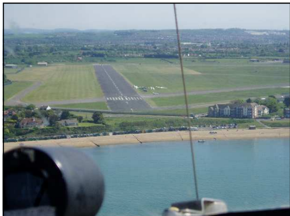
Finals to Lee on Solent

I visited the Sports Leisure Aviation show at the NEC Birmingham in late 2009. I have always retained an interest in the light side of aviation having previously flown some early weight shift microlights and hang gliders. Lighter aviation was well represented with an amazing number of powered parachutes available plus some single seat SS DR weightshifts. The LAA had a stand as did the Royal Institute of Navigators (RIN). The RIN stand had a competition running where there was a series of airfield photos which you had to match to airfields on the ½ mil chart. This seemed quite fun so I entered. A couple of weeks later I found I had won a prize of annual membership to the RIN. The RIN has many members from all the armed services (current and Ex) and includes many sailors and flyers.